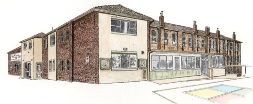
St Canice's Catholic Primary School Katoomba 2017

158 Katoomba Street (PO Box 200) Katoomba NSW 2780